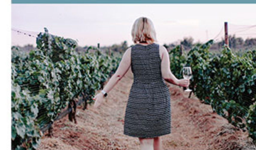
TABLE MOUNTAIN & CITY

Start with a visit to Paarl where you will be struck by the beauty of the Valley. Enjoy a wine tasting and cellar tour at one of the estates. Continue to Franschhoek, founded in 1688 by French immigrants fleeing the Huguenot religious persecution in Europe. A memorial in the town commemorates the arrival of these settlers who helped develop the wines sought after by Napoleon, Bismarck and royalty. Stop for lunch (for own account) and another wine tasting at a vineyard. Head to Stellenbosch, the second oldest town in South Africa. In 1679 Dutch East India Company governor, Simon van der Stel, recognized the fertility of this valley as perfect for vineyards. A blend of 18th century Cape Dutch, Georgian and Victorian buildings is evident on Dorp Street. Enjoy a final wine tasting before returning to Cape Town.