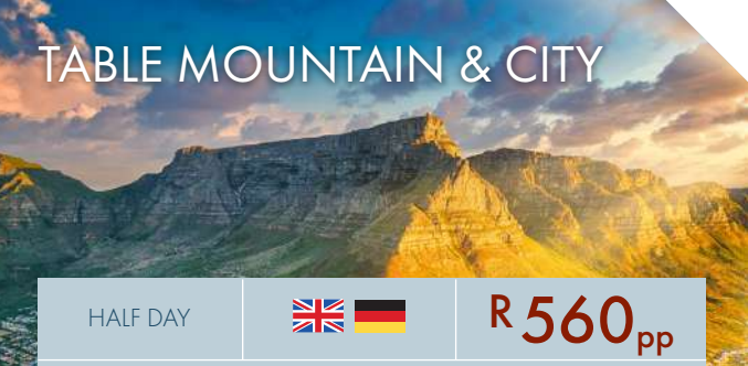
TABLE MOUNTAIN & CITY